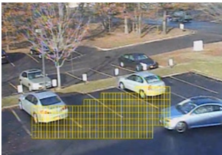
Find a specific episode