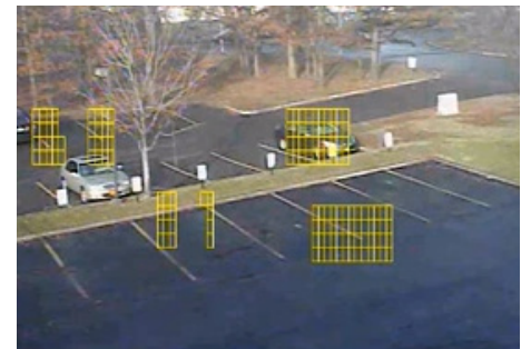
Create several searches at once